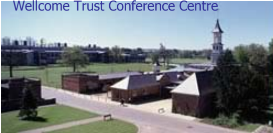
Wellcome Trust Conference Centre